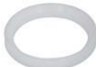
SPACER FOR BUSHING Ø 30X6X5 MM

LF Code: 9391012 GEV Code: 702030 OEM p/n: R40-34